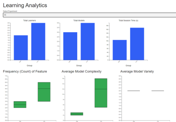
Figure 4: Researchers are provided standard and VERA specific analytic metrics automatically at the end of each experiment.

a problem. A learner may place two biotic components and a relationship, such as consumes, between the biotics to model a system. Another learner may model the same system using two biotics and an abiotic, and a differing set of relationships among the three components. To help researchers understand the difference in such behaviors, two custom metrics are available to researchers for each user at the end of an experiment: model complexity (the sum of components used to construct a model) and model variety (the sum of unique components used to construct a model). These custom metrics are paired with traditional descriptive statistics such as the total number of learners in an experiment and automatically provided to researchers in numerical and visual form to exemplify the enabling automated analysis principle.