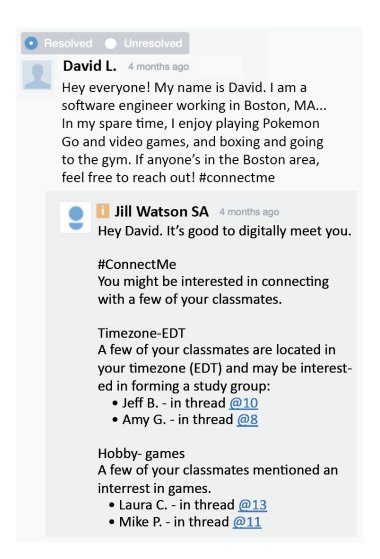
Figure 2: An adapted example of Jill Watson SA's personalized response to an online student on Piazza, based on location and hobby.