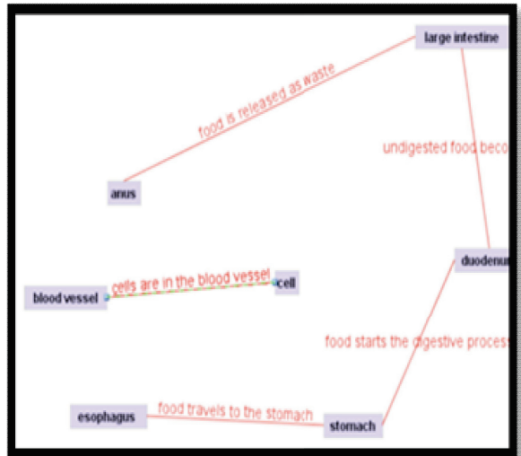
Figure 4 Digestive System Student ACT Model